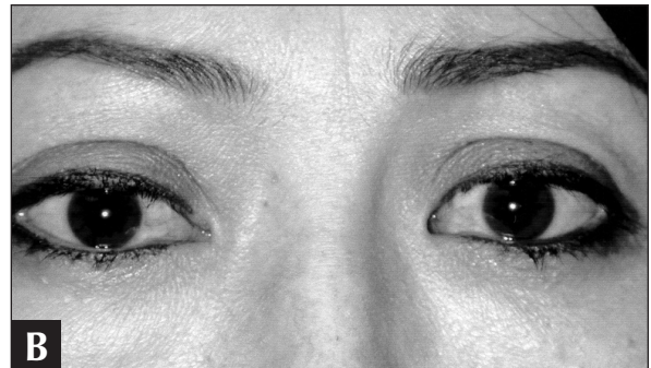
Figure 2. (A) Preoperative photograph of patient 9 showing upper eyelid retraction and esotropia. (B) Postoperative photograph of patient 9 after upper eyelid retraction repair and medial rectus recession.

patients were offered adjustable extraocular muscle suture surgery and 4 patients consented to and received it. Four patients underwent bilateral medial rectus recession; in 2 of these patients, adjustable sutures were used. The remaining 5 patients had one of the following: medial and inferior rectus recession, a recess/resect procedure, bilateral medial rectus recession, posterior fixation, and right medial rectus recession. The patients were observed for an average of 11 months (range: 1 to 29 months). Postoperative eyelid measurements and extraocular motility measurements were recorded.